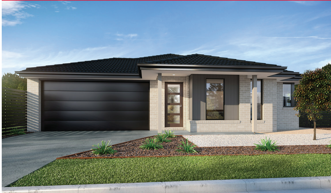
CURRAWONG 16_155 | SIMONDS RANGE